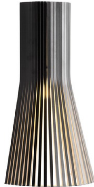
Shown in: Black Laminated Birch

Secto 4231 Wall features a shade made from laminated birch slats available in Natural Birch, White Laminated Birch, Black Laminated Birch or Walnut Birch. Fixture can be mounted so that the light streams upward or downward. ETL listed.