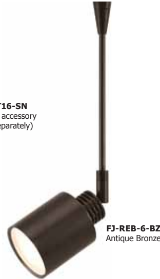
FJ-REB-6-BZ Antique Bronze