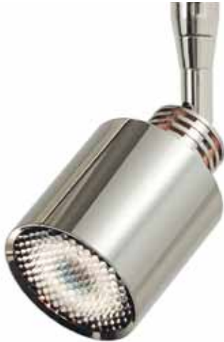
FJ-REB-1-PN Polished Nickel