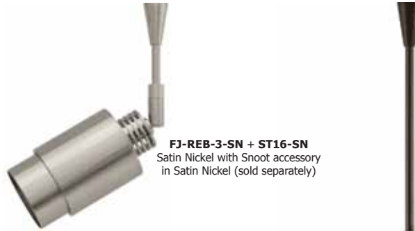
FJ-REB-3-SN + ST16-SN Satin Nickel with Snoot accessory in Satin Nickel (sold separately)