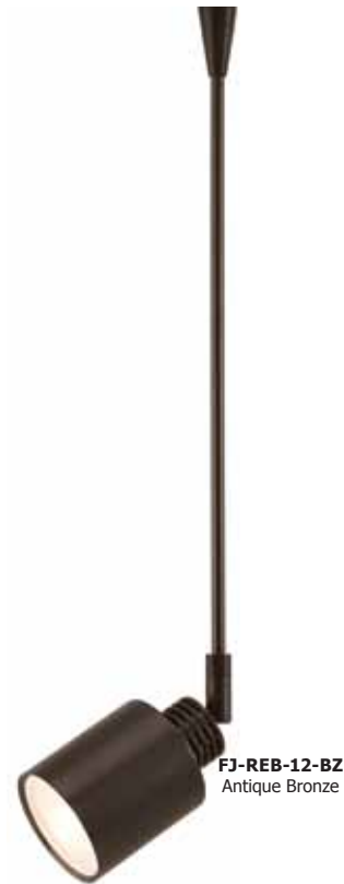
FJ-REB-12-BZ Antique Bronze