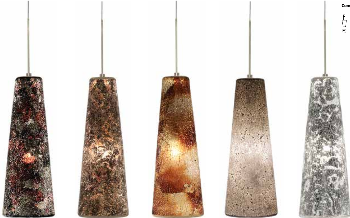
FJ-TOL-SGB-12-SN Shattered Golden Burgundy