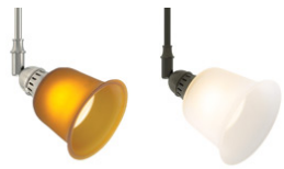
hurricane amber stained nickel