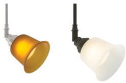
hurricane amber hurricane frost