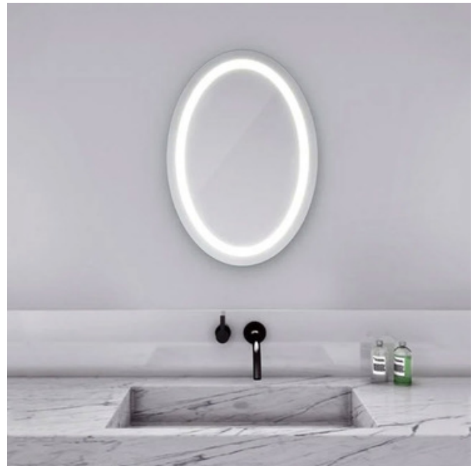
Shown in: Mirror

The Eternity Oval Lighted Mirror is designed to maximize direct illumination. Ideal for precision tasks such as makeup application and shaving. White powder coated chassis for finished side view. Corrosion resistant DuraMirror glass. Choice of standard forward phase control or with Ava dimming. Ava Smart Look technology features tunable white LED lights that allow you to select the color temperature. Select between 6500K for a day of outdoor activities, 4600K for your daily routine, or 2700K for a night out on the town. Tap to Cycle through 2700K, 4600K, 6500K, Night Glow and Off. At every level, hold to dim down to 10%. After one hour of non-use, Energy Save Mode automatically dims lights to 10%. Note: The Eternity Oval mirror must be installed in the W x H (width x height) orientation as listed; it cannot be installed in any other direction.