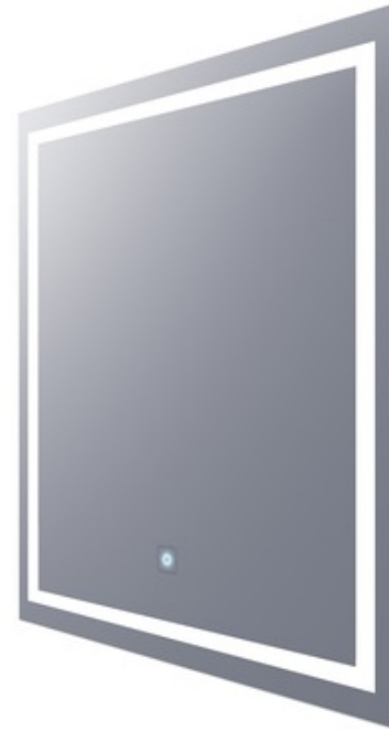
Shown in: Mirror

The Integrity Rectangle Lighted Mirror is designed to maximize direct illumination. Ideal for precision tasks such as makeup application and shaving. White powder coated chasis for finished side view. Available in eight sizes with standard or Ava control options. Standard control option allows for control with an on/off switch or forward phase dimming switch. Ava may be controlled by an external on/off light switch or with the Ava touch control located 6 inches up from the bottom of the mirror. Ava Smart Look technology features tunable white LED lights that allow you to select the color temperature. Select between 6500K for a day of outdoor activities, 4600K for your daily routine, or 2700K for a night out on the town. Tap to Cycle through 2700K, 4600K, 6500K, Night Glow and Off. At every level, hold to dim down to 10%. After one hour of non-use, Energy Save Mode automatically dims lights to 10%. Note: The Integrity mirror must be installed in the W x H (width x height) orientation as listed; it cannot be installed in any other direction.