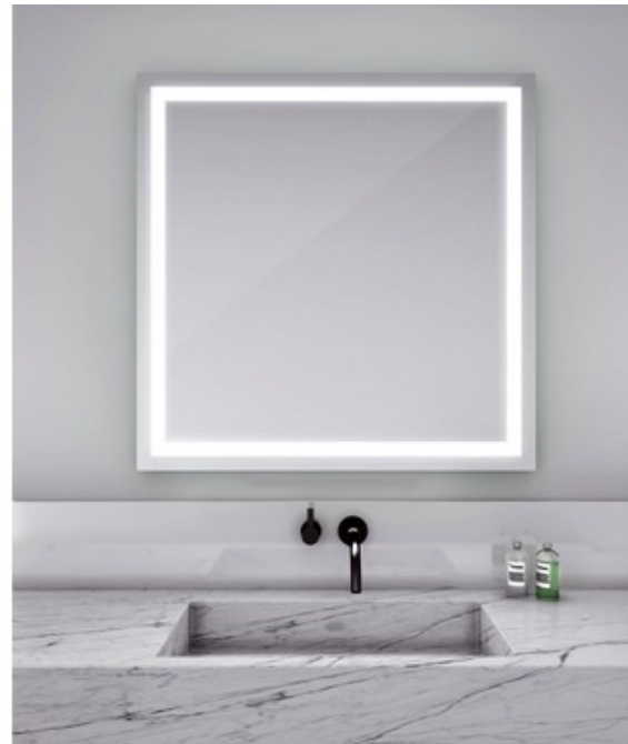
Shown in: Mirror

The Integrity Square Lighted Mirror is designed to maximize direct illumination. Ideal for precision tasks such as makeup application and shaving. White powder coated chasis for finished side view. Corrosion resistant DuraMirror glass. Available in two sizes. Choice of standard control or with AVA dimming. Ava Smart Look technology features tunable white LED lights that allow you to select the color temperature. Select between 6500K for a day of outdoor activities, 4600K for your daily routine, or 2700K for a night out on the town. Tap to Cycle through 2700K, 4600K, 6500K, Night Glow and Off. At every level, hold to dim down to 10%. After one hour of non-use, Energy Save Mode automatically dims lights to 10%. UL and cUL listed for damp locations. ADA compliant.