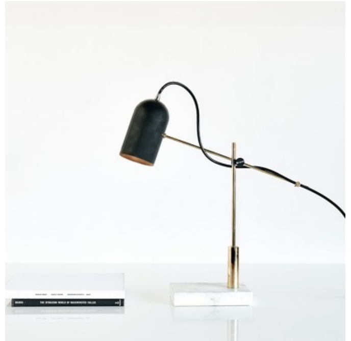
Shown in: Brass / Black

The Deadstock Catherine Table Lamp was designed around a cylindrical shade salvaged from a defunct lighting factory. The base is made from Carrara marble and the support is made of machined brass. Available with a Gunmetal Black or a White powder-coated shade. Inline dimmer on cord.