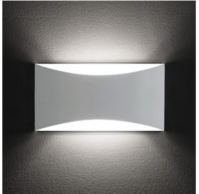
Shown in: White / White

The Kelly Wall Sconce, designed by Studio 63, is an elegantly designed, minimalist object. The rectangular metal shade is made from curved, laser-cut metal and directs the light both upwards and downwards creating diffused, pleasant light.