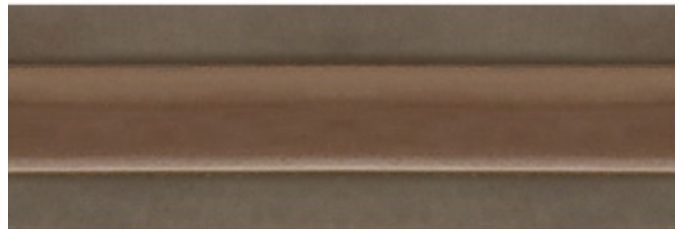
Shown in: Antique Bronze/Brown Insulator

Hand bendable, field-cuttable Monorail is rated for 300 watts at 12 volts, 600 watts at 24 volts. Each piece of rail is shipped with conductive connectors to join rail pieces end to end. Order additional connectors (sold separately) if cutting and rejoining rails. Finish in Antique Bronze with Brown Insulator, Antique Bronze with Clear Insulator, or Satin Nickel with Clear Insulator. ETL listed. Available in 24, 48 and 96 inch lengths. 0.3 inch width x 0.6 inch height.