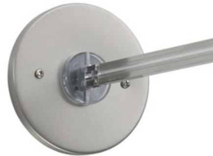
Shown in: Satin Nickel

A direct-end power feed canopy is mounted to a wall or ceiling perpendicular to the monorail run. It brings power to an end of the monorail run from a remote transformer (sold separately). The low-voltage leads from the remote transformer are connected to the canopy leads inside the electrical box the canopy mounts to the electrical box. 4 inch round canopy: mount to a standard 4 inch electrical box with round plaster ring(not included). 2 inch square canopy: mount to tech lighting's special 2 inch square, 3.5 inch deep electrical box with mounting bar (included). 2 inches x 4inches rectangular canopy: mount to a single gang or gem box (provided by electrician). Finish available in antique bronze or satin nickel. For use with a single feed remote transformer (sold separately.) ETL listed. 4 inch width x 4 inch height x 1.3 inch length.