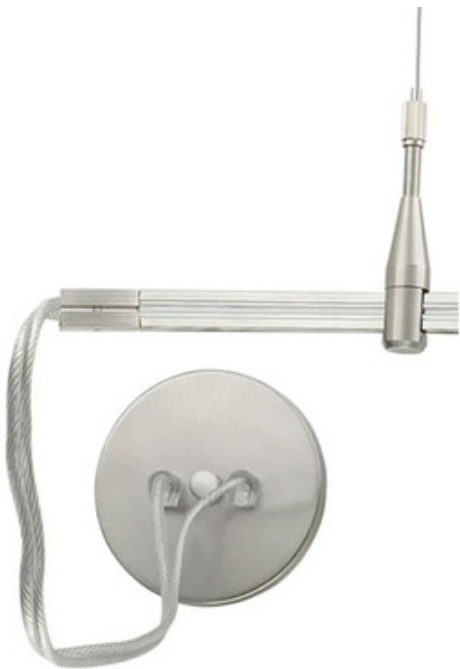
Shown in: Satin Nickel

Pair of end feed connectors brings power to a Monorail system when the transformer cannot be located directly above the run. The power feed can be mounted to a standard 4 inch junction box with round plaster ring (provided by electrician), directly to a remote transformer or to a Kable Lite surface transformer (sold separately). The end power feed pushes into an end of the Monorail and includes a removable 4 inch round canopy and 12 feet of field-cuttable softwire leads. Finish in Satin Nickel or Antique Bronze. ETL listed. 4 inch width x 4 inch height x 144 inch length.