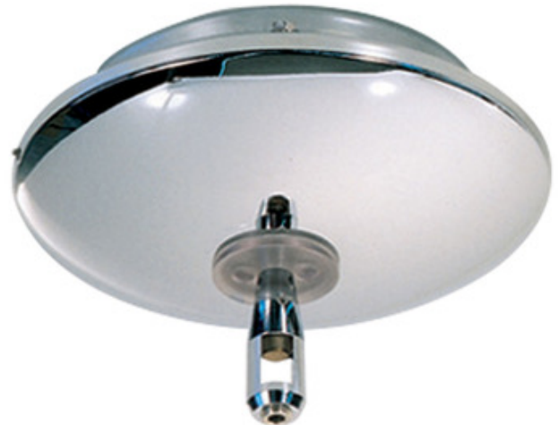
Shown in: Satin Nickel

The Monorail 150 Watt Single Feed Magnetic Surface Mount Transformer converts standard 120 volt line-voltage to 12 volts to provide the necessary voltage for powering a Monorail low-voltage lighting system. It can power lamps totaling up to 150 watts. Finish available in Satin Nickel or Antique Bronze. The transformer is concealed inside a decorative housing with a fast acting secondary circuit breaker that will safely turn the system off should a short occur. Once the short has been removed the unit can be reset by simply flipping the wall switch off and back on. The shortest rigid standoff that can be used with this transformer is the 3 inch rigid standoff, sold separately. If dropping the rail more than 3 inches below the ceiling, order the desired rigid standoff length and one compatible power extender, sold separately. ETL listed. 6.5 inch diameter x 3.6 inch height. Dimmable with a low voltage magnetic dimmer, sold separately. As a general rule when using LED fixtures we do not recommend using greater than 70% of specified maximum wattage on the transformer due to inrush current.