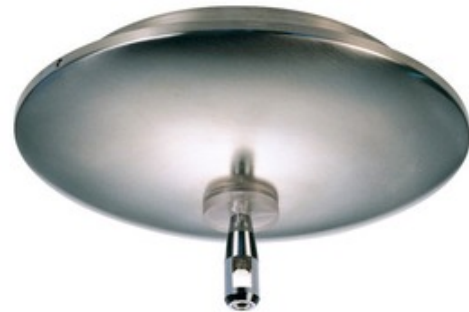
Shown in: Satin Nickel

The Monorail 300 Watt Single Feed Electronic Surface Mount Transformer converts standard 120 volt line-voltage to 12 volts to provide the necessary voltage for powering a Monorail low-voltage lighting system. It can power lamps totaling up to 300 watts. The transformer is concealed inside a decorative housing with a fast acting secondary circuit breaker that will safely turn the system off should a short occur. Once the short has been removed the unit can be reset by simply flipping the wall switch off and back on. The shortest rigid standoff that can be used with this transformer is the 4 inch rigid standoff, sold separately. If dropping the rail more than 4 inches below the ceiling, order the desired rigid standoff length and one compatible power extender, sold separately. Dimmable with a low voltage electronic dimmer, sold separately.