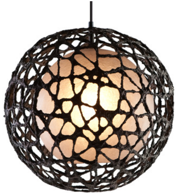
Shown in: Brown

The C U C Me Round Hanging Lamp features the charming beauty of woven wire dipped into salago fiber and powder-coated. Hand woven wire frame. The lampshade diffuser is handmade paper laminated mylar and sits within the textural frame, radiating a soft warm glow. Available in three sizes. Note: 39 inch version size does not fit through standard door frames