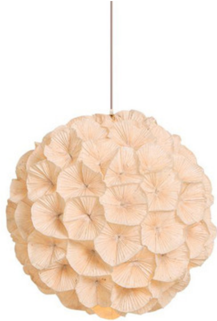
Shown in: Cream

The Poppy Suspension takes pride in its feminine grace of warm glowing flowers. In a single lamp, meticulously hand-folded paper blossoms are attached to each other then wired to a metal frame to form a full floral impression.