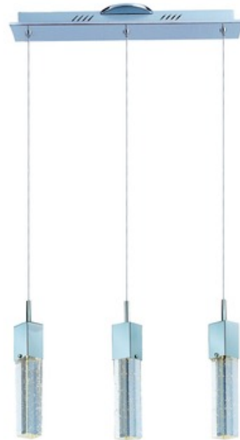
Shown in: Polished Chrome / Etched Bubble

The Fizz III LED Linear Suspension features an Etched Bubble diffuser with a Polished Chrome finish.