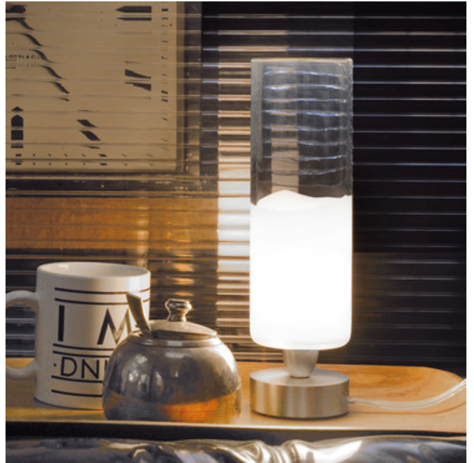
Shown in: Nickel / White

The Lio Table Lamp features a Satin Nickel base with a blown glass diffuser created with a technique that enables modelling a white glass band into several layers of crystal.