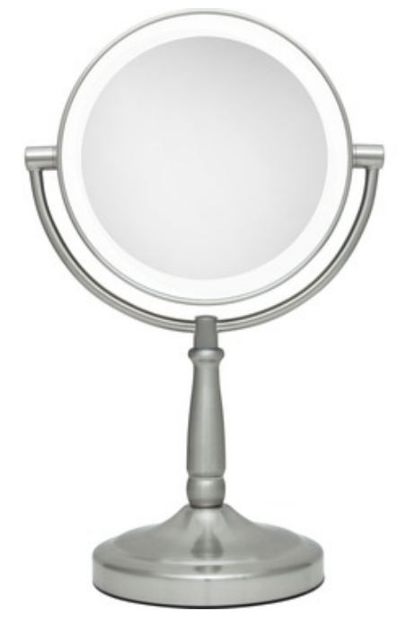
Shown in: Satin Nickel / Mirror