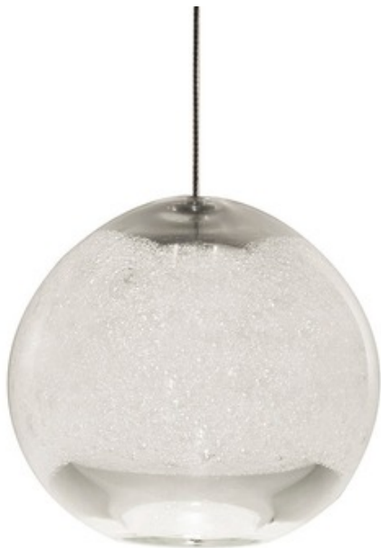
Shown in: Satin Nickel / Clear Bubble

The Bubble Small Orb Pendant focuses on the way glass forms and light play with each other. Whipped glass clouds the bulb on the bubble lights. These low voltage fixtures can be hung singularly from a monopoint canopy or as a grouping for a statement piece. Hand blown and shaped in lead free crystal. No molds are used, and each glass shape is unique. Includes male FreeJack connector. Requires a FreeJack canopy, not included.