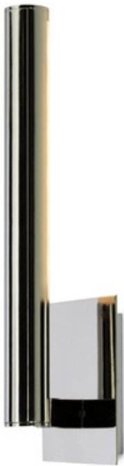
Shown in: Polished Nickel / Frosted White

Zo Zo Wall Sconce is a linear wall washing LED luminaire. Steel construction with plated steel body in Polished Nickel finish and frosted white acrylic spread diffuser. Dimmable with C.L/LED+ and ELV dimmers. Note: This is a discontinued fixture and limited to quantity on hand.