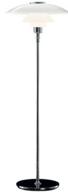
Shown in: Chrome / Opal

PH 4 1/2 - 3 1/2 Glass Floor Lamp, designed by Poul Henningsen, is based on the principle of a reflective three shade system, which directs the majority of the light downwards. The shades are made of hand-blown opal three layer glass, which is glossy on top and sandblasted matte on the underside, giving a soft light distribution. Available with Opal glass and a Chrome finish. Includes 108 inch black cord with inline on / off switch.