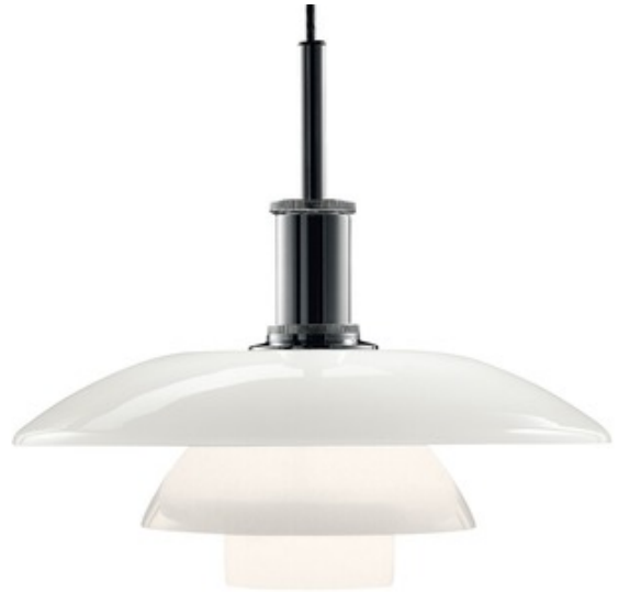
Shown in: Chrome / Opal

The PH 3/2 Pendant, designed by Poul Henningsen, is based on the principle of a reflective three shade system, which directs the majority of the light downwards. The shades are made of hand-blown opal three layer glass, which is glossy on top and sandblasted matte on the underside, giving a soft light distribution. Available in Opal glass with a Chrome finish.