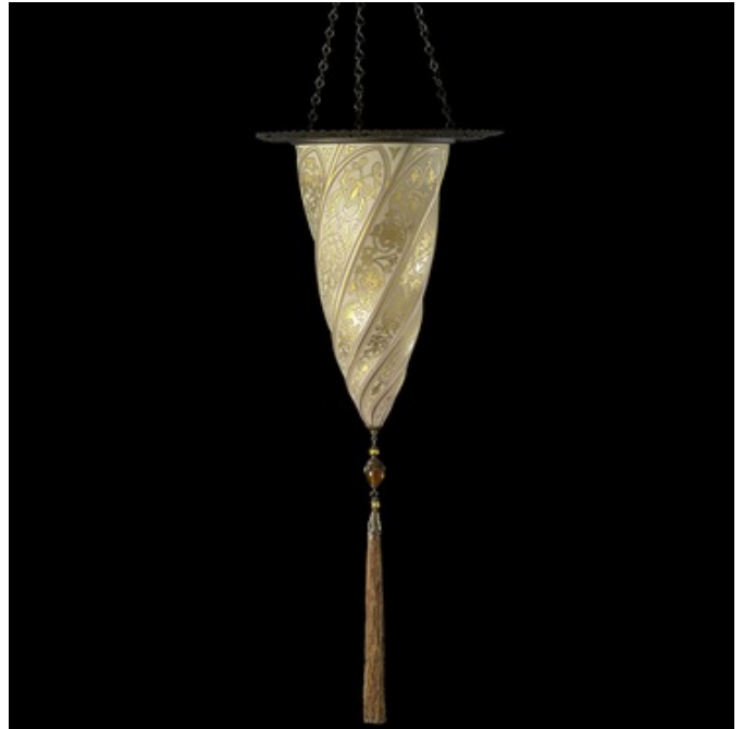
Shown in: Brass / Gold Classic

The Cesendello Glass Ring Wall Sconce is designed after the sanctuary lamps whose roots are born in Rome and Byzantium. The decorative glass is complemented by a decorative ring and a tassel. Available in Gold Classic, Silver Classic, White Classic, Red Mosaic, and Gold Mosaic. Tassel is 11.5 inches in length. Made in Italy.