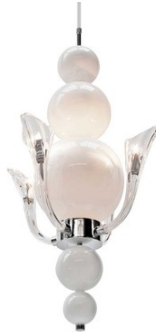
Shown in: Chrome / White

Tears From Moon Pendant features White and Black handmade glass in a Chrome finish. 20W 12V G9 base halogen lamps are required, but not included. Small: 16.1 inch width x 28.7 inch height x 59 inch length. Large: 28.7 inch width x 29.5 inch height x 39.4 inch length.