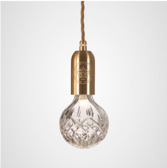
Shown in: Brass / Clear

Clear Crystal Pendant is available in a Brass or Polished Chrome finish with Clear lamps. Also available as a chandelier or bulb. The pendant fitting, engraved with the Lee Broom logo, creates a clean and simple outline with the Clear Crystal Bulb. Each pendant fitting includes matching Gold or Silver fabric cable and a Brushed Brass or Polished Chrome ceiling rose. Taking inspiration from the delicate craftsmanship of crystal cutting, Crystal Bulb combines industrial influences with decorative qualities, transforming the everyday light bulb into a beautiful ornamental light fitting. Each lead Crystal Bulb is handcrafted using traditional techniques and hand cut with a classic crystal pattern inspired by those found on traditional whiskey glasses and decanters.