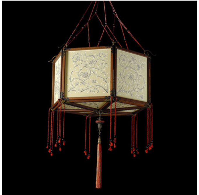
Shown in: Brass / Ivory Classic Silk

The Concubina Loto Pendant brings memories of the Orient to your space. Features Plain Ivory or hand painted Ivory Classic silk panels surrounded by wood and accented with Brass and fiery red thread details. Made in Italy. Note: Overall height is not adjustable and must be specified to order. Minimum / Maximum height: 39 / 52.75 in.