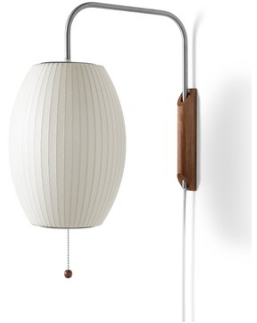
Shown in: Brushed Nickel/ Walnut / White

Nelson Bubble Lamps designed by George Nelson produced by Herman Miller. The George Nelson Bubble Lamp Cigar Wall Sconce is constructed with a 2 inch thick solid walnut wall mount and a Brushed Nickel steel arm. Shade is a taut White plastic coating over a steel wire frame. The arm has a swivel hinge and an adjustable 12-foot plug-in cord with a counterweight that allows for height adjustments. This clever design allows one to adjust the sconce from left-to-right and up-and-down without having to change its position on the wall.