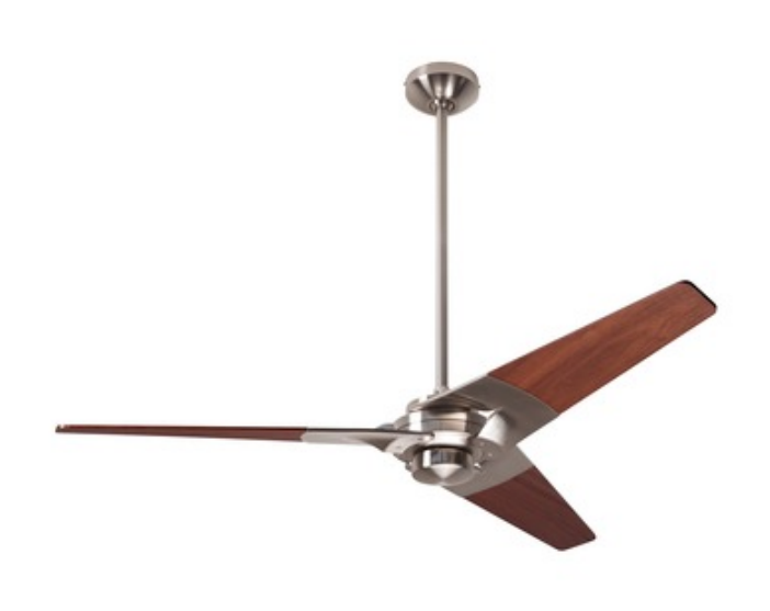
Shown in: Bright Nickel / Mahogany Wood