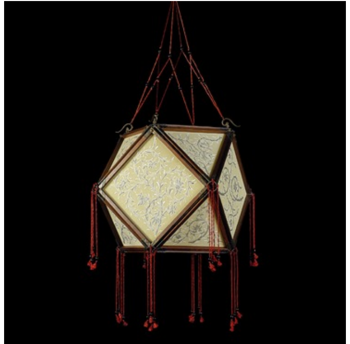
Shown in: Brass / Ivory Classic Silk

The Concubina Tempio Pendant is a true masterpiece, bringing luxury and elegance in any space in your home. Features larger squares and smaller triangles of Ivory Classic or Ivory Plain silk surrounded by wood and accented with Brass and fiery red thread details. Note: Overall height is not adjustable and must be specified to order. Minimum / Maximum height: 30.25 / 44 in.