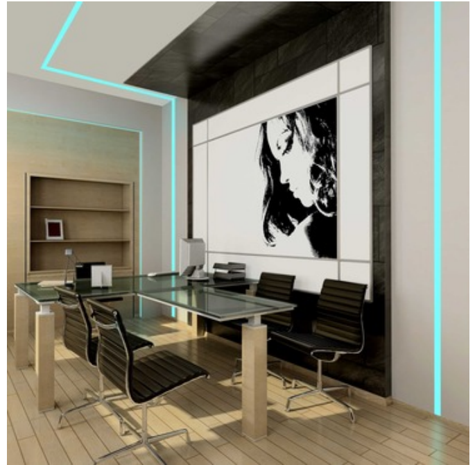
Shown in: White

TruLine .5A RGB Plaster-In 24VDC LED system provides smooth and glare-free general illumination using designer-grade high CRI LEDs. TruLine .5A recesses within 5/8 inch drywall without any joist modification. The slim extrusions, LED strips, and lenses are available in 1 foot increments up to 20 feet (before re-feeding) and are field-cuttable. Includes 5 watts/foot LED module in RGB (Red-Green-Blue) color temperature option. Can be installed on a single surface, join runs on multiple planes from wall to ceiling, or from one wall to an adjacent wall. Use TruLine .5A Build-It-Yourself (BIY) with pre-formed components to create desired configurations including mitered picture frame and outside or inside corners for room wrapping installations. Included components: TruLine .5A channel(s), LED RGB Soft Strip, TL.5A Junction Box, Take-Up Box, Adjustable Mounting Bars, Mounting Strap, Power End Cap, Drywall Screw, and Lenses. A DMX color changing power supply is required and must be used with PureEdge controller (CDMX1-RGBW or CDP), sold separately. Note: Required power supply, dimmer/controller, and optional accessories sold separately. Product is built to order