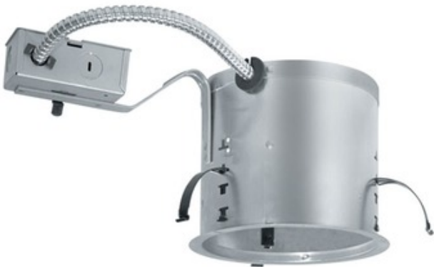
Shown in: Aluminum

IC21R 6 Inch IC Remodel Housing is an energy efficient sealed housing. IC remodel housing for remodel application where back side of ceiling is not accessible. Installs through an opening in the ceiling from below. Secured in place by factory installed remodel springs. Can be completely covered with insulation. When used with Air-Loc gasket (ALG6R), stops infiltration and ex-filtration of air, reducing heating and cooling costs. Trims shown with Air-Loc symbol do not require a gasket. One 120 volt, A19, BR30, PAR30, PAR30L, PAR20 or R20 medium base lamp or LED equivalent is required, but not included. Lamp type and wattage dependent upon housing/trim combination (see attached Juno manufacturer specification). Incandescent/halogen dimmable with a standard incandescent dimmer. Consult lamp manufacturer for dimmer compatibility when using an LED equivalent lamp. UL listed for through-branch wiring, damp locations and IP. Product thermally protected against improper use of lamps. Trim 241 is wet location approved for covered ceiling applications. 13.75 inch length x 7.3 inch width x 5.75 inch height. A complete fixture includes a housing and trim, sold separately.