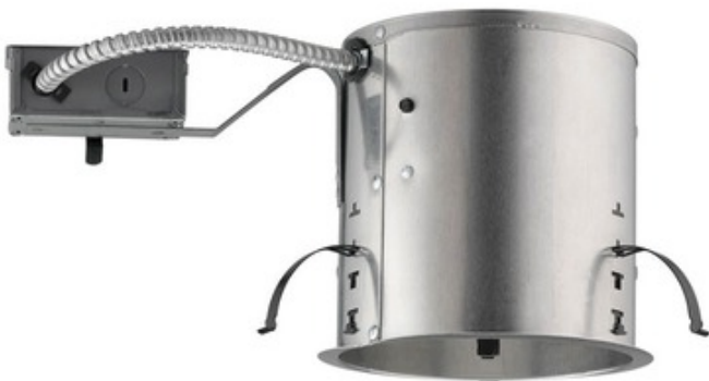
Shown in: Aluminum

IC22R 6 Inch IC Remodel Housing is an energy efficient sealed housing. IC remodel housing for remodel application where back side of ceiling is not accessible. Installs through an opening in the ceiling from below. Secured in place by factory installed remodel springs. Can be completely covered with insulation. When used with Air-Loc gasket (ALG6R), stops infiltration and ex-filtration of air, reducing heating and cooling costs. Trims shown with Air-Loc symbol do not require a gasket. One 120 volt, A19, BR30, PAR30, PAR20, R20, PAR30L or PAR38 medium base halogen/incandescent lamp or LED equivalent is required, but not included. Lamp type and wattage dependent upon housing/trim combination (see attached Juno manufacturer specification). Incandescent/halogen dimmable with a standard incandescent dimmer. Consult lamp manufacturer for dimmer compatibility when using an LED equivalent lamp. UL listed for through-branch wiring, damp locations and IP. Product thermally protected against improper use of lamps. Trims 239, 241 and 242 are wet location approved for covered ceiling applications. Trims 28 and 28 are wet location approved for covered ceiling applications when used with outdoor rated lamps. 13.75 inch length x 7.3 inch width x 7.1 inch height. A complete fixture includes a housing and trim, sold separately.