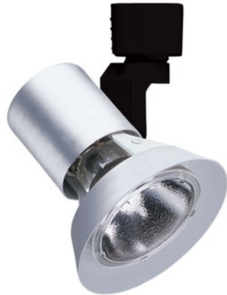
Shown in: Satin Chrome

R531 PAR20 Flared Gimbal Track Fixture features a drawn steel housing with stamped gimbal ring available in White, Black, Bronze or Satin Chrome. 90 degree vertical aiming capability and 358 degree rotation. Copper alloy contacts provide precise spring action. True, positive electrical ground. On/off switch included. Patented embossed polarity arrows on bottom of adapter. Spring-loaded locking latch with embossed polarity arrows secures trac light to track. Pull-up contact to up position for use on two-circuit track. One 50 watt, 120 volt PAR20 medium base lamp is required, but not included. UL listed. Compatible with Juno Lighting Trac-Lites, Trac-Master 1-circuit and Trac-Master 2-circuit 120 volt line voltage track systems.