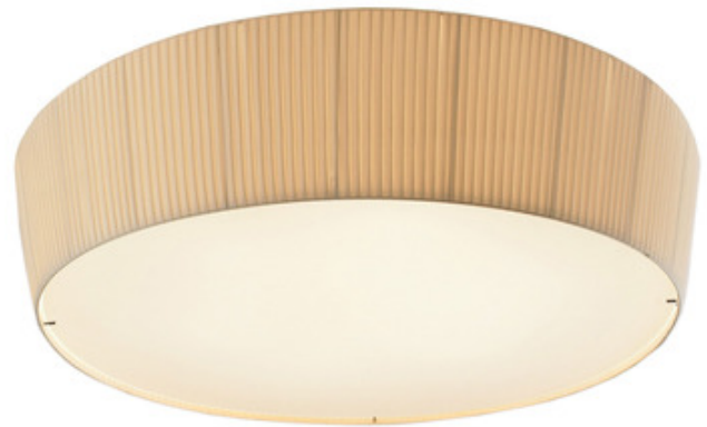
Shown in: Stainless Steel / Cream Translucent Ribbon

Plafonet Ceiling Flush Mount features a hand wrapped White or Cream translucent polyester blend ribbon shade, or a White cotton shade. Finish in Stainless Steel. Includes frosted polycarbonate injection-molded diffuser. Available in two sizes. Requires 60 watt 120 volt A15 medium base incandescent lamps, not included. UL listed. Dimensions: Small: 14.57 inch diameter x 5.91 inch height. Medium: 21.26 inch diameter x 5.91 inch height.