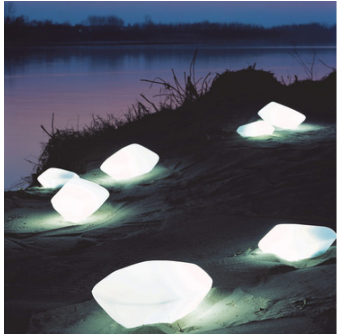
Shown in: White / White

The shape of the Stones Outdoor Lamp is inspired by nature. These luminous stones, available in three different sizes, can be positioned alone or in a group placed in a garden or on a terrace.