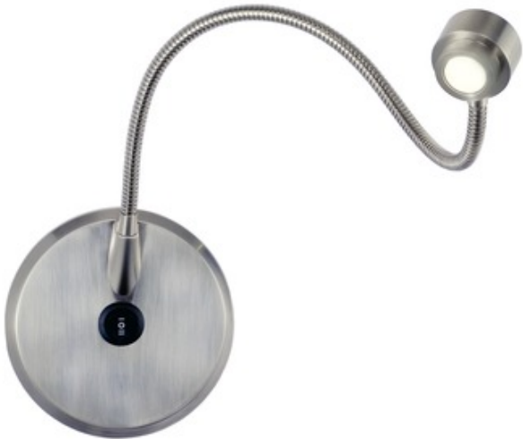
Shown in: Satin Nickel

The Night Owl 1 was designed for those who enjoy reading late at night, but do not want to disturb others. The 15 inch gooseneck arm allows the lamp to be easily positioned in any direction. Includes one 2 watt 12VAC LED and integral LED power supply which fits inside electrical box. Features a rocker switch on the canopy to control the intensity of the light. 5 year warranty.