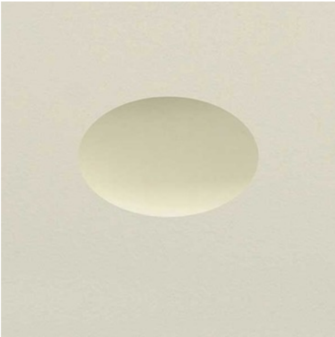
Shown in: White Trim/ Haze Dome