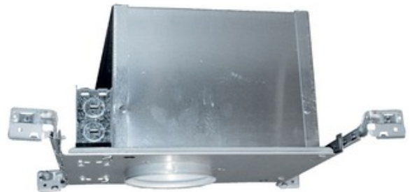
Shown in: Aluminum

IC1P 4 inch New Construction IC Housing features an energy efficient, double wall housing made of aluminum. IC designation allows for housing to be covered with insulation with no separate gasket required. Socket is detachable medium base porcelain with nickel-plated copper screw shell. UL listed for through-branch wiring, damp and IP. Product thermally protected against improper use of lamps. One 120 volt medium base lamp is required, sold separately. Lamp type and wattage dependent on housing/trim combination. A complete fixture includes a housing and trim, sold separately.