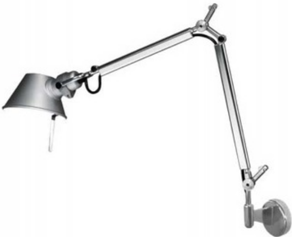
Shown in: Aluminum

Tolomeo Micro Wall Light with J Bracket (hardwire) features a fully articulated arm and body structure in extruded natural anodized aluminum. Joints and tension control knobs in polished die-cast aluminum and tension cables in stainless steel. Diffuser in anodized aluminum. Type J bracket suitable for direct wire to a junction box. Diffuser is tiltable and is 360 degree rotatable on lampholder. INC: One 60 watt, 120 volt G16.5 candelabra base incandescent lamp, but is not included. On/off switch. 4.4 inch diameter shade x 16.1 inch height x 19.9 inch depth x 29.1 inch fully extended arm. UL listed.