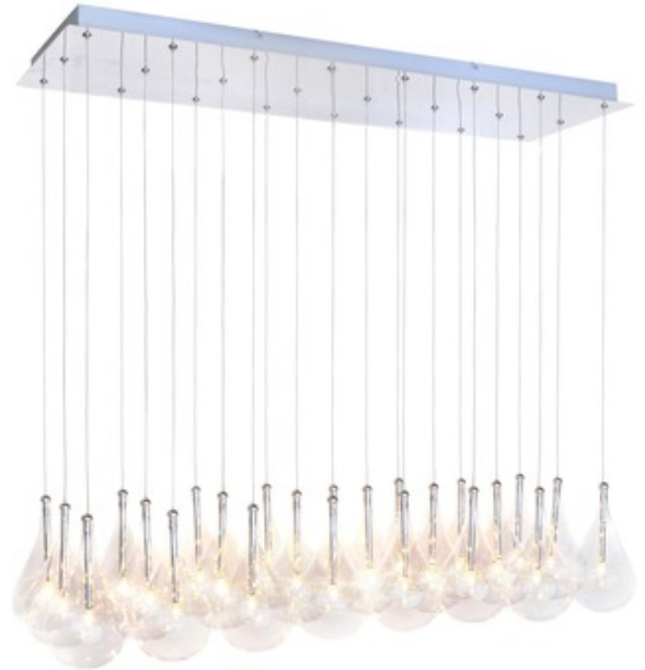
Shown in: Polished Chrome / Clear

Larmes Linear Suspension features gracefully oversized Clear glass teardrops mounted onto a Polished Chrome lamp holder. 20 watt, 12 volt, T3/G4 base Xenon Halogen bulbs are included. 24 Light: 10 watt, 12 volt, T3/G4 base Xenon Halogen bulbs are included. 37.5 inch width x 8 inch height x 122 inch overall length.