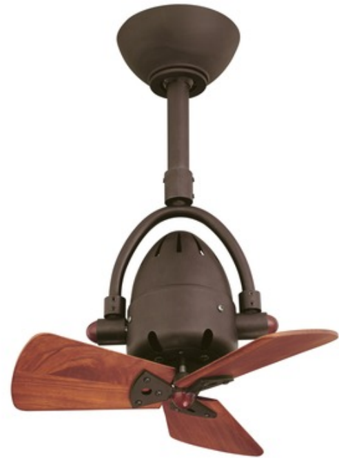
Shown in: Textured Bronze / Mahogany Wood

The Atlas Fan Diane Wood Ceiling Fan is an oscillating directional fan that provides maximum, multi-directional airflow. Designed to be hung in small, awkward spaces or in front of HVAC ducts to make more efficient the heating, ventilation, or air conditioning of any room. AC motor construction of cast aluminum and heavy stamped steel in Polished Chrome, Matte Black, Brushed Nickel or Textured Bronze finish with Black, Barnwood, or Mahogany tone solid wood blades. Features a 16 inch blade span and 19 degree pitch. 90 degree forward and reverse sweeping oscillating function. Includes a vaulted ceiling canopy for up to 29 degrees, 10 inch downrod, and a 3-speed RF remote control in Black. ETL listed. Suitable for damp locations. Limited lifetime warranty.