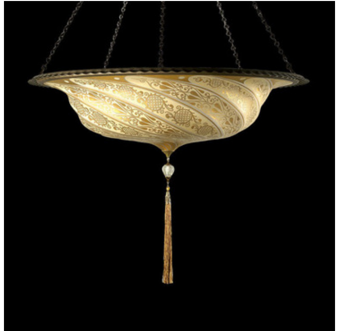
Shown in: Brass / Gold Classic

The Scudo Saraceno Glass Pendant is inspired by the Saraceno Shield from Medieval times. The glass is complemented by striking details with a brass structure finish and a dark brown canopy in a stylistic Turkish -Venetian motif. Made in Italy. NOTE: Not all options are available. Small Minimum / Maximum height: 29.63 / 64.5 in. Medium Minimum / Maximum height: 34.25 / 65.38 in. Large Minimum / Maximum height: 40.5 / 67 in. NOTE: Overall height is not adjustable and must be specified to order.