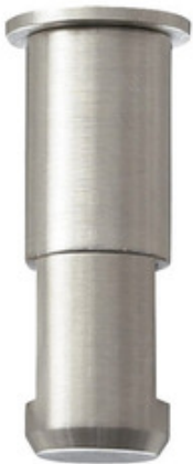
Shown in: Satin Nickel

The Monorail 1 Inch Rigid Standoff is designed for use with the Tech Lighting Monorail system and allows mounting the rail closest to the ceiling. It is compatible with the Monorail low-profile power feed canopy and the Monorail low-profile remodel recessed transformer. It is not compatible with the Monorail standoff vault adapter. Not field cuttable.