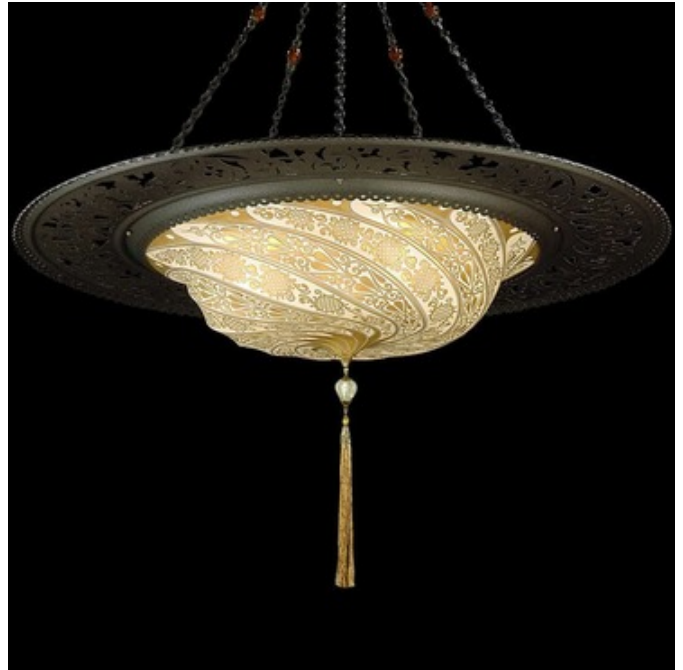
Shown in: Brass / Gold Classic

The Scudo Saraceno Glass Ring Pendant is inspired by the Saraceno Shield from Medieval times. The delicate silk is complemented by striking details with a brass structure finish, decorative ring, and a dark brown canopy in a stylistic Turkish -Venetian motif. Available in White Classic, Silver Classic, Gold Classic, Red Mosaic, or Gold Mosaic. Made in Italy. NOTE: No Gold Mosaic in smallest size. Note: Overall height is not adjustable and must be specified to order. Small Minimum / Maximum height: 30.38 / 50.75 in. Medium Minimum / Maximum height: 32 / 55.25 in. Large Minimum / Maximum height: 35.5 / 65 in.