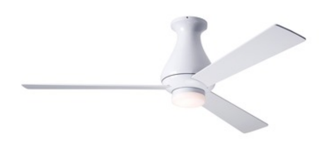
Shown in: Gloss White / White