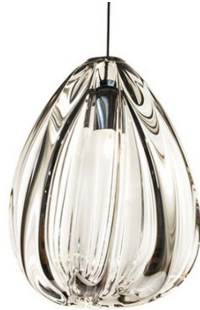
Shown in: Antique Bronze / Clear

The Small Thick Barnacle FJ Pendant focuses on the way glass forms and light play with each other. Hand rendered texture creates unique projected patterns on the urchin and barnacle lights. These low voltage fixtures can be hung singularly from a monopoint canopy or as a grouping for a statement piece. Hand blown and shaped in lead free crystal. No molds are used, and each glass shape is unique. Canopy required and sold separately. Includes male FreeJack connector.