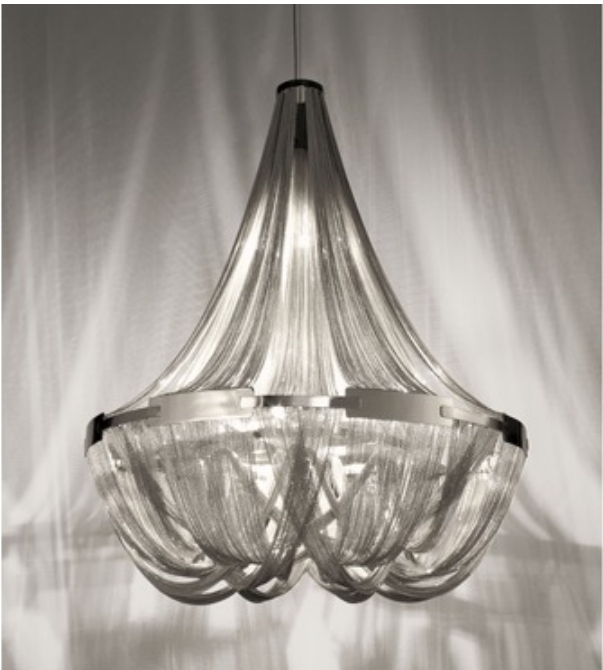
Shown in: Nickel

Soscik Chandelier, designed by Nicolas Terzani, combines traditional, artisan techniques with cutting-edge technology giving a classic chandelier a modern look. Created by interlacing metal chain over a frame finished in Nickel, Bronze, or Gold. It creates a dramatic and romantic effect, but also compliments today's modern look. It proves that modern design does not have to sacrifice luxury. Available in small, medium, and large sizes. ETL listed.