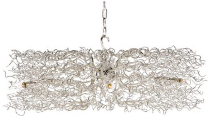
Shown in: Nickel

The Hollywood Round Chandelier features sculpted metal in an organic design, evocative of bare branched trees. Light reflects off the sinewy branches of this sculptural masterpiece. Each fixture is a unique, hand crafted piece, and comes with a certificate of authenticity. NOTE - Medium and Large versions require a special rated junction box for fixtures weighing over 50 pounds.